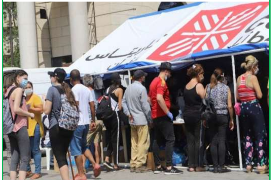
The funds raised will be used to provide immediate and longer term assistance through Caritas Lebanon.

All donations made through Caritas Australia are tax deductible.